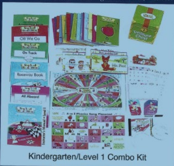
Kindergarten/Level 1 Combo Kit

because not much needed to change! The educational heart of the program is still the same.